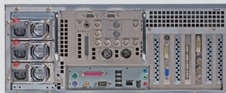
Rear View of ProntoHD.2